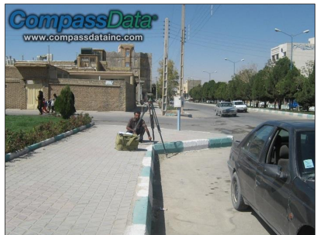
Figure 7. Elevated Curb as GCP

3.2.4 Elevated features: The ideal feature has the same elevation as its surrounding, i.e. it is not an elevated feature. However, ground control points are measured in real world. When there is a lack of flat man-made structures, corners of elevated features can supply good control. Nevertheless, each height of elevated feature, even the height of small curbs, should be noted in the point's metadata.