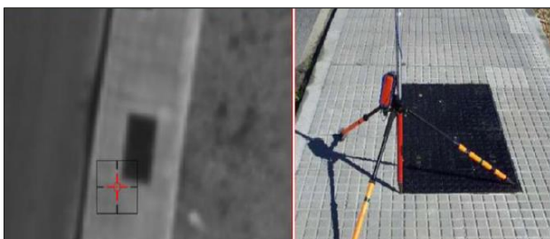
Figure 5. This black vault is visible on high resolution imagery, but will blend in with lower resolution imagery by satellites.

3.2.2 Dimension: There can be a feature with great contrast but still not suitable for processes of orthorectification or calibration. The dimensions of the point's feature have to be bigger than the resolution of the imagery used in further applications. The majority of the points in the archive was collected using the rule of thumb that the feature must be at least 2 times, ideally 3 times bigger than the resolution of the imagery.