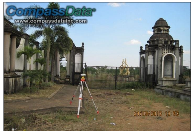
Figure 2. Difficult Photo-identifiable GCP

A rare concrete corner that still doesn't provide a clear geometry due to the raised elevation, the ornamental slope, vicinity of trees, and the lack of contrast – nevertheless one of the best features at this given location.