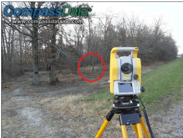
Figure 8. Total station and surveyed test point under vegetation in red circle

3.2.5 Requirements for LiDAR point clouds: LiDAR point cloud data also requires GCPs. Obviously points used for LiDAR products have different requirements. Feature identifiability does not depend on the color contrast. Often it is not even required to identify the horizontal location and solely the vertical component is important. It is distinguished between data controlling points and testing points. Both types are in the open and unobstructed from any vegetation, but used differently in the process either as a control point or a test point to quantify the quality. Also there are points that are purposely surveyed under vegetation to test the vegetation removal process.