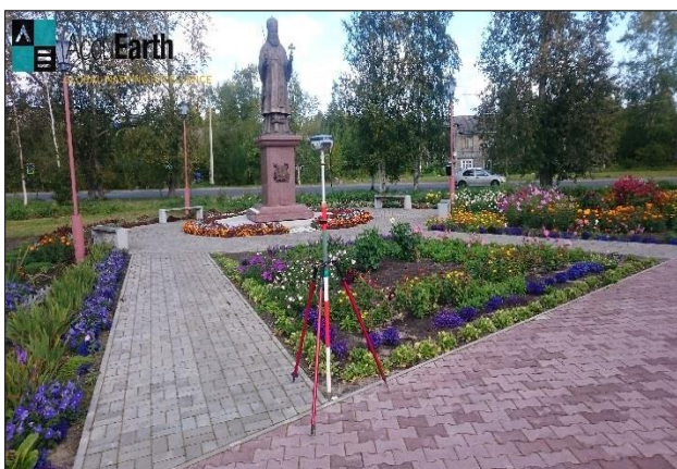
Figure 1. Clear Photo-identifiable GCP

There are challenges ranging from the obvious logistical deployment to the final processing of the data, as well as the availability of clearly defined features at the site. The availability challenge is frequently the toughest one. In the most parts of the developed world the infrastructure of the road network provides concrete and asphalt corners, white stripes, manholes and so forth while in other parts of the world the road network consists of gravel roads without such preferred features. Below is a nice flowerbed with clear geometry that is ideal as a photo-identifiable feature for satellite imagery.