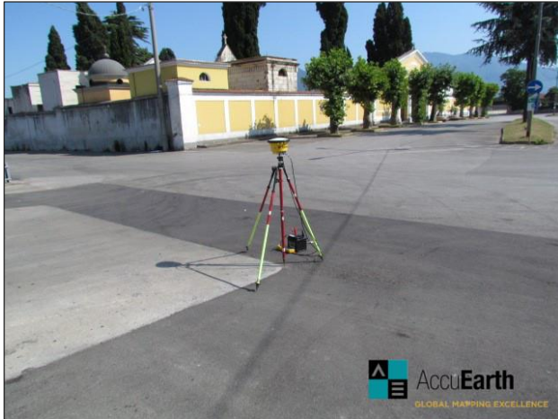
Figure 3. Asphalt and Concrete - different shades of Grey

3.2.1 Contrast: The contrast between the features representing the ground control point and its surrounding must be evident. The characteristics of the feature's materials and its surroundings have to be considered as well since some materials can change contrast over time. For example, it may appear that a corner of new asphalt patch on a road is a great point at the time, however dark black asphalt color is usually fades quickly and it loses its contrast with the surrounding road, or it is likely to happen that a field with no vegetation during winter can be fully vegetated during spring and summer.