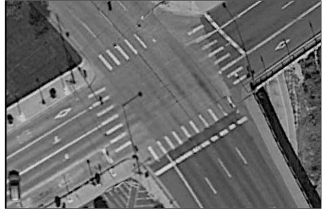
Figure 6. In this aerial image the white stripes seem to be clearly defined, while the visit in the field revealed that the corners were faded and not usable.

3.2.3 Sharp edges: Standard GNSS processing achieves a horizontal accuracy far better than 10 cm. In order to make sure that this horizontal accuracy can be fully utilized, the feature collected has to be clearly identifiable on the imagery, not only regarding its contrast but the sharpness of the feature edges. The sharper the edges, the easier it is to determine the position on an image. Painted features often deteriorate quicker than sharp hard features such as sidewalk corners.