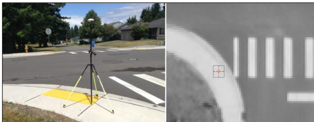
Figure 4. Contrast of a yellow feature is undetectable in the black and white imagery

Moreover, it is important to take into account that the ground control points can be used on black and white imagery. In cases like this choosing point with appropriate contrast is even more important.